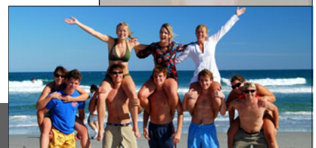
and...there's more on the back! →